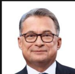
Dr. Joachim Nagel

Chairman & Chief Executive Officer Ant Group