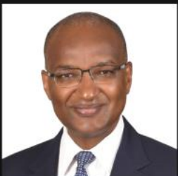
Dr. Patrick Njoroge