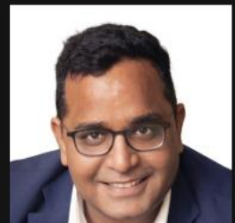
Vijay Shekhar Sharma