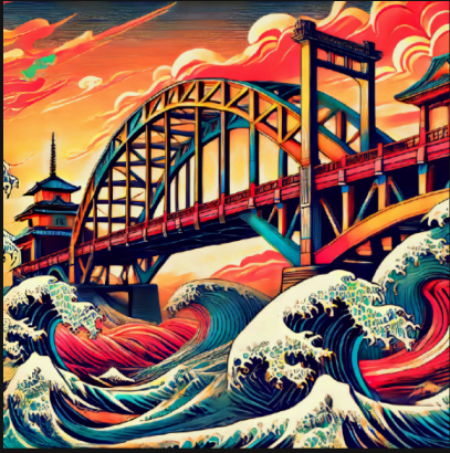
BELLESALLE NIHONBASHI (3 - 4 Mar)