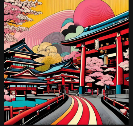
KANDA MYOJIN SHRINE (5 - 6 Mar)