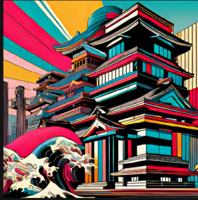
JAPAN STOCK EXCHANGE (4 Mar)